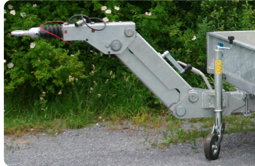
Height adjustable drawbar (model 441/3500)