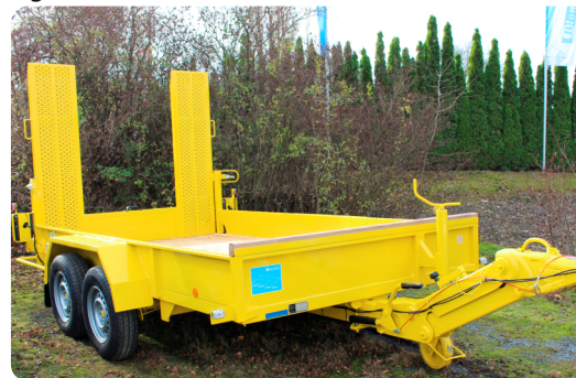
Varnishing in the colour at buyer's option instead of galvanizing