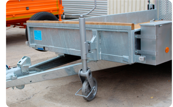
Big support wheel with 700kg support load - mounted at the strengthened frontwall