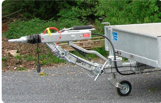
Height adjustable drawbar (up to 3150kg TW)