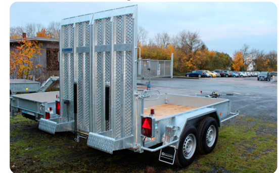
Closed loading ramp, 1x lengthway divided