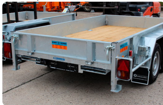
Ramps inserted underneath the loading area, with rear lid