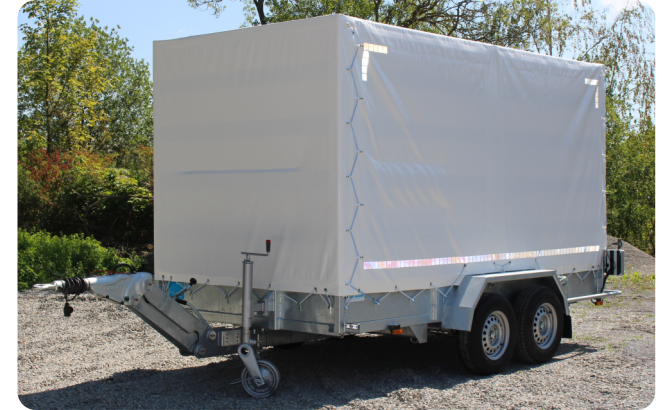
Tarpaulin top, strong support wheel and height adjustable drawbar