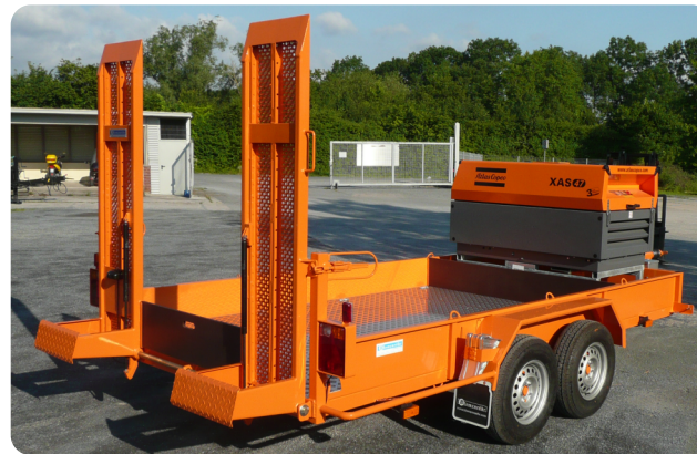
Minitrailer with mounted compressor and aluminium-chequer plate floor