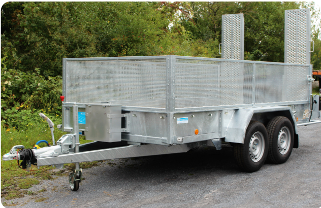
Minitrailer with attachment for leaves and box at the front wall