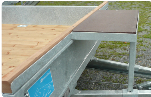
Shelf for excavator shovel - Hardwood wedge and/or tray table mounted at the front wall