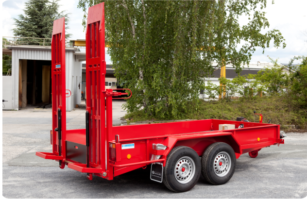
Minitrailer for the transport of lifting platform