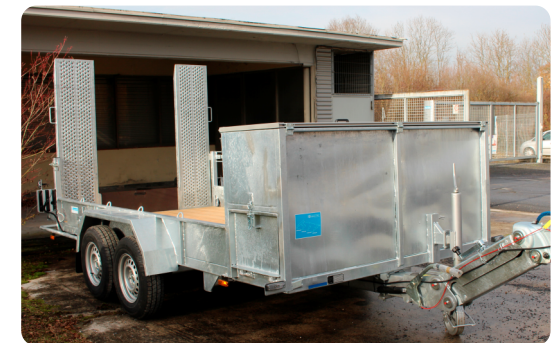
Double storage box - to be loaded from above and through flaps from the sides

as well without photos: different loading measures, net hooks, further lashing points, spare wheel and holder, winch, ramps with wooden surface etc.