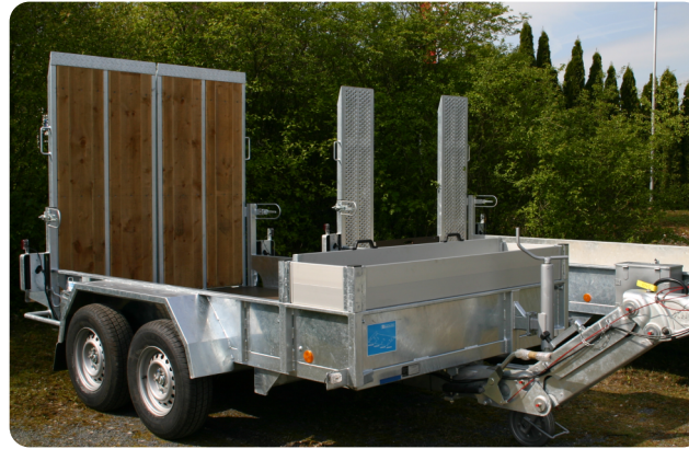
Minitrailer with section in front, closed loading ramp with wooden surface