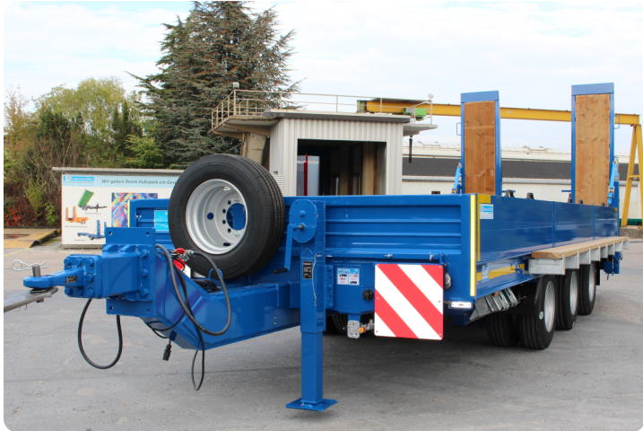
Tridem 25t TW with insertable side walls made of aluminium, width extendable to 3,0m, warning package (with a connector and holder for a rotating beacon as well as illuminated extendable warning sides) and spare tyre