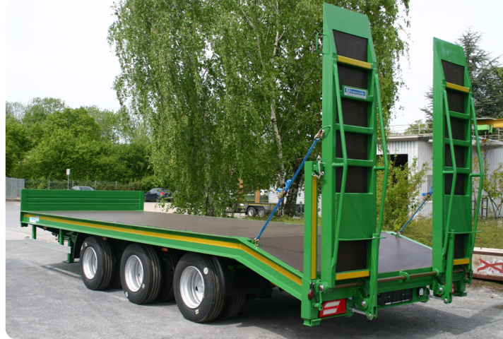
Tridem 25t TW, with full LED-lighting

➤ A Tridem is a centre-axle trailer with three axles. It is pulled by a rigid, not height adjustable drawbar. A Tridem usually is exploited to transport very high payload (approx 20t). However there apply many demands upon the towing vehicle: