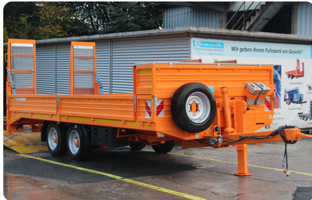
Double storage case - below with sideways flaps and an aluminium flap for the loading from the top, hardwood on the flap for the excavator shovel, widened ramps, divided side walls, spare tyre and net hooks