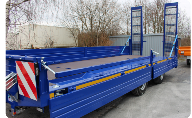
Combo-transport trailer: suitable for the transport of roll-off containers and construction machinery - with insertable guide for the roll-off containers