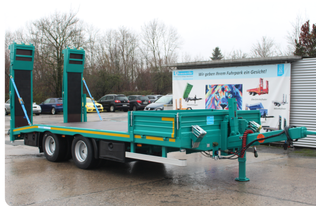
Special rubber surface in the ramps and bevel, ramps extended and foldable, divided front loading area with detachable sidewalls and border