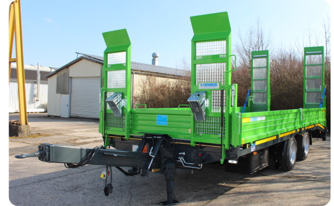
Ramps with 3,5t payload /pair in front - to drive up onto the pulling truck. With hydraulically height adjustable drawbar, front wall and insertable front posts