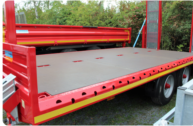
Side profile with double perforation „oval hole and half moon“ (2000daN lashing capacity) with lashing cases in the middle (4000daN)