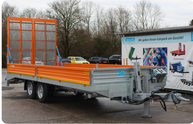
Galvanized chassis and front wall, sidewalls and ramps varnished in the RAL-colour of your choice, with closed loading ramp and hydraulic ramp lifters