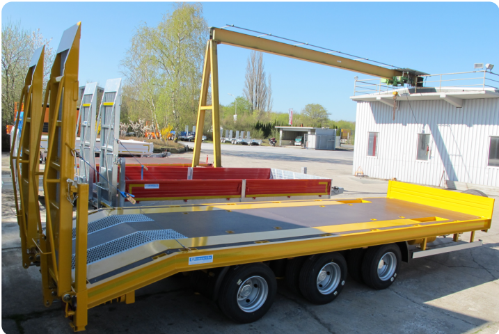
Tridem 25t TW, as a combo-trailer for the transport of roll-off containers and construction machinery